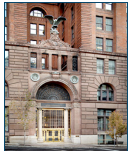
The scope of the project and the ultimate success in matching finishes with the original structure are demonstrated by this view of the building

Bullet Resistant Gold Mirror Stainless Steel