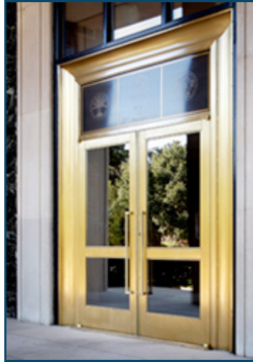
Main Entrance to Linda Hall Library Brass Door & Frame

"What does 'specialized' mean to us? It means doors and frames built to perform to our clients' specifications... it means our customers, whose special needs we strive to address ..."