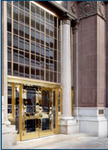
Entrance to New England Insurance - Aquila Energy Corporation Bullet Resistant Gold Mirror Stainless Steel